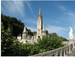
World Famous Pilgrimage Destination

Historic Buildings and Monuments, Visitor Centres and Museums