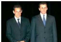
Wax Museum of Famous French People Past & Present

Tours and Trips, Visitor Centres and Museums