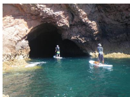
Stand Up Paddleboarding at Baleal, Peniche & Obidos. We have some amazing adventures including a River Paddle visiting the Berlengas Islands!