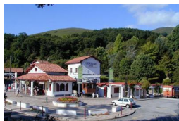
Antique Wooden Train climbs to summit of La Rhune

Sare, 64310, Pyrenees-Atlantiques, France