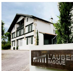
2009 1star Michelin Restaurant

Helbarron Saint-Pee, 64310, Pyrenees-Atlantiques, France