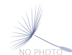
Terra Sana's catering service and restaurants use only the best ingredients and the service is unbeatable, making it the #1 choice in Marbella