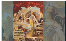
Natural caves with staligmites and lake and train

Historic Buildings and Monuments, Tours and Trips, Childrens Attractions