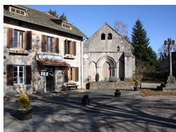
Local Bar and Restaurant