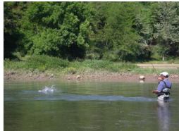
Fly Fishing with a Professional Guide

Pau, 64000, Pyrenees-Atlantiques, France