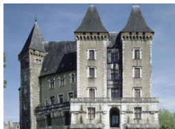
Most Important Chateau of the Bearn

Art Gallery, Visitor Centres and Museums