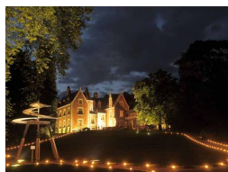
Château du Clos Lucé - Parc Leonardo da Vinci; Leonardo da Vinci's residence

Amboise - Val de Loire France, 37400, Indre-et-Loire, France