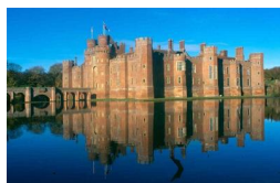
Magnificent moated castle in East Sussex

Hailsham, BN27 1RN, East Sussex, England