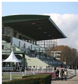
Restaurant at Pau Race Course

Pau, 64000, Pyrenees-Atlantiques, France