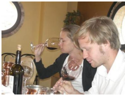
International wine fair