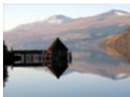
Archaeological Open-Air Museum

Historic Buildings and Monuments, Visitor Centres and Museums