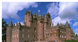
Childhood home of Her Majesty Queen Elisabeth The Queen Mother

Glamis, DD8 1RJ, Angus and Dundee, Scotland