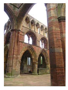
42. Lanercost Priory Historic Buildings and Monuments

A beautiful haven of peace and tranquility