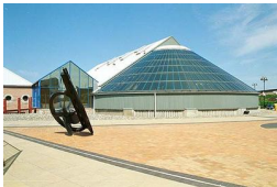
Home to a wealth of objects and information on the social and industrial history of the Furness area

Historic Buildings and Monuments, Visitor Centres and Museums, Childrens Attractions, Indoor and Outdoor Play Areas, Cafes Coffee Shops and Tearooms