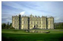
World Famous Stately Home and Safari Park in Wiltshire

Warminster, BA12 7NW, Wiltshire, England