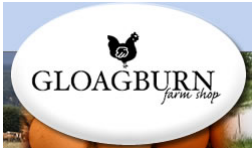
The Gloagburn Farm Shop and Café are a local business of high quality offering local produce as well as a café.

Tibbermore, PH1 1QL, Perth and Kinross, Scotland