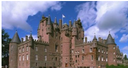
Childhood home of Her Majesty Queen Elisabeth The Queen Mother

Glamis, DD8 1RJ, Angus and Dundee, Scotland