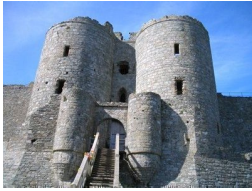
Pinnacle of Medieval castle building