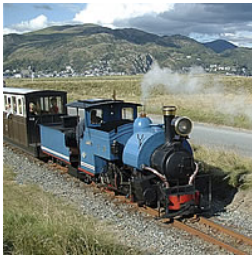
Beautiful steam railway and Nature Reserver in mid Wales