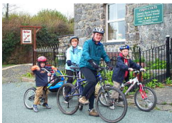
Cycle Hire in the Dysynni Valley, South Snowdonia near Tywyn & Aberdovey