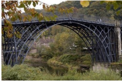
Birthplace of the Industrial Revolution