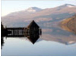
Archaeological Open-Air Museum

Kenmore Aberfeldy, PH15 2HY, Perth and Kinross, Scotland