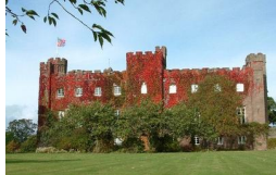
Scone Palace occupies a unique position in Scottish History

Historic Buildings and Monuments, Parks Gardens and Woodlands