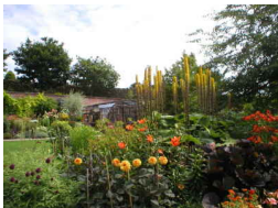
Beautiful gardens near Windermere - home to the Lakeland Horticultural Society