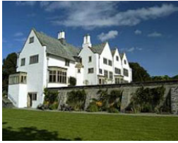
The Arts & Craft House