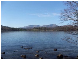
The longest natural lake in England

Lochs Lakes and Waterfalls, Tours and Trips, Visitor Centres and Museums, Childrens Attractions, Sailing and Watersports, Boat Trips, Guided Tours and Day Trips