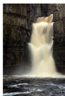
Take a walk around Teesdale and the Waterfall at High Force.

Lochs Lakes and Waterfalls, Parks Gardens and Woodlands