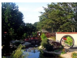
A lush and beautiful park with a tranquil lake, offering pedalo and rowing boats, hot and cold food, drinks, and of course ice cream.

Lochs Lakes and Waterfalls, Parks Gardens and Woodlands