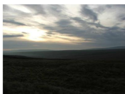
Dramatic landscape between County Durham and Cumbria