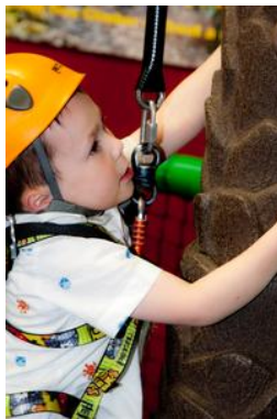
Children's Indoor &amp; Outdoor Play Centre

Darlington, DL1 4PT, County Durham, England