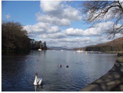
Country park beside Lake Windermere

Newby Bridge, LA12 8NN, Cumbria, England