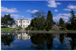
Aboretum, Woodland Garden, Bird of Prey and Mammal Centre

Bedale, DL8 2PR, North Yorkshire, England