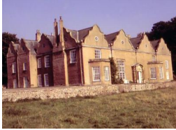
Country House and gardens

Historic Buildings and Monuments, Parks Gardens and Woodlands