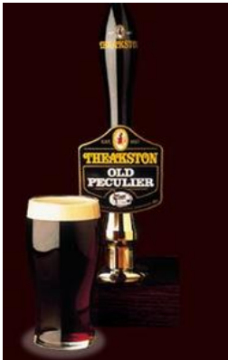
Brewery Visitor Centre

Ripon, HG4 4YD, North Yorkshire, England