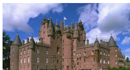
Childhood home of Her Majesty Queen Elisabeth The Queen Mother

Glamis, DD8 1RJ, Angus and Dundee, Scotland