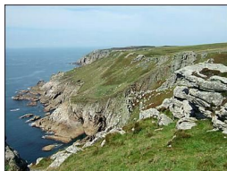
Lundy Island and Nature Reserve