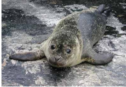
Boat Trips and Seal Sightings

Plockton, IV52 8TN, The Highlands, Scotland