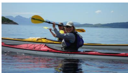
Sea kayaking for all levels from the beautiful village of Plockton.

Drumbuie, IV40 8BD, The Highlands, Scotland