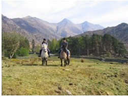
Pony trekking in the Highlands of Scotland

Lochalsh, IV40 8HW, Western Isles, Scotland