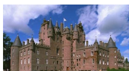
Childhood home of Her Majesty Queen Elisabeth The Queen Mother

Glamis, DD8 1RJ, Angus and Dundee, Scotland