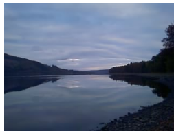
Loch Venachar, The Trossachs

Callander, FK8 3EN, Stirlingshire, Scotland