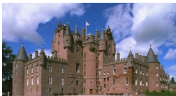
Childhood home of Her Majesty Queen Elisabeth The Queen Mother

Glamis, DD8 1RJ, Angus and Dundee, Scotland