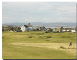
9 hole golf course in Portmahomack Easter Ross

Portmahomack, IV20 1YA, The Highlands, Scotland