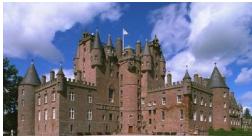
Childhood home of Her Majesty Queen Elisabeth The Queen Mother

Glamis, DD8 1RJ, Angus and Dundee, Scotland