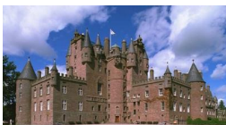
Childhood home of Her Majesty Queen Elisabeth The Queen Mother

Glamis, DD8 1RJ, Angus and Dundee, Scotland