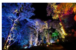
The Enchanted Forest offers visitors a unique opportunity to experience the outdoors, at night and with spectacular imagery. You will experience a lighting show that is out of this world.

Festivals and Events, Lochs Lakes and Waterfalls, Parks Gardens and Woodlands, Live Music and Comedy