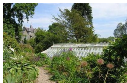
Victorian Fernery and Enchanting Garden

Ascog, PA20 9EU, Argyll and Bute, Scotland