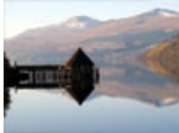
Archaeological Open-Air Museum

Historic Buildings and Monuments, Visitor Centres and Museums