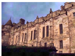
Furnished Historic Palace

Historic Buildings and Monuments, Parks Gardens and Woodlands