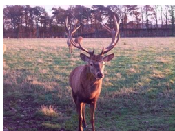
Wildlife Park and adventure playground in Fife

Parks Gardens and Woodlands, Indoor and Outdoor Play Areas, Zoos Farms and Wildlife Parks