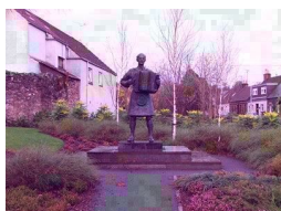
Sculpture to the legendary Sir Jimmy Shand