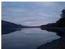
Loch Venachar, The Trossachs

Callander, FK8 3EN, Stirlingshire, Scotland