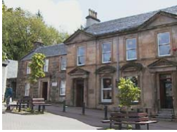
Museum of and for the West Highlands

Fort William, PH33 6AJ, The Highlands, Scotland