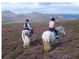
Trail Riding and Pony Trekking