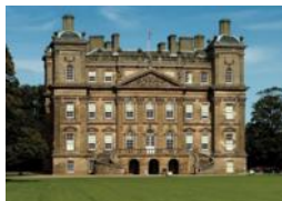
Historic House and Cultural Arts Centre

Banff, AB45 3SX, Aberdeenshire, Scotland