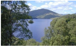
Woodland and Conservation Area

Lochs Lakes and Waterfalls, Parks Gardens and Woodlands, Walking and Climbing