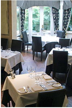
Award winning restaurant near Perth in Scotland

Perth, PH2 8EB, Perth and Kinross, Scotland