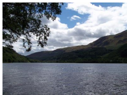
Small Loch Near Callander

Callander, FK17 8HD, Stirlingshire, Scotland