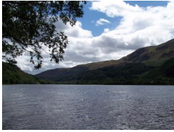
Small Loch Near Callander

Callander, FK17 8HD, Stirlingshire, Scotland