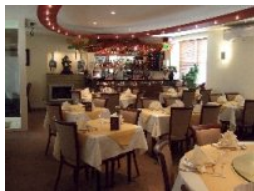
'A Hidden Gem' - Kelso Life July 2007

Kelso, TD5 7DN, Scottish Borders, Scotland