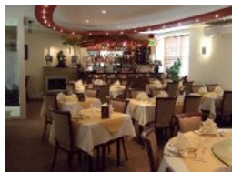
'A Hidden Gem' - Kelso Life July 2007

Kelso, TD5 7DN, Scottish Borders, Scotland