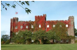
Scone Palace occupies a unique position in Scottish History

Historic Buildings and Monuments, Parks Gardens and Woodlands