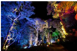
The Enchanted Forest offers visitors a unique opportunity to experience the outdoors, at night and with spectacular imagery. You will experience a lighting show that is out of this world.

Festivals and Events, Lochs Lakes and Waterfalls, Parks Gardens and Woodlands, Live Music and Comedy