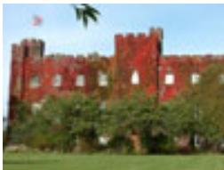
Former crowning place of the Kings of Scotland, stunning setting in beautiful grounds. A stately home to visit.

Historic Buildings and Monuments, Parks Gardens and Woodlands