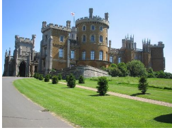
Home of Duke and Duchess of Rutland

Festivals and Events, Historic Buildings and Monuments, Parks Gardens and Woodlands