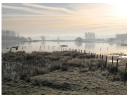
Open all year, this is the ideal location to relax in natural beauty, enjoy a country walk and get closer to nature on one of Europe's top reserves.

Lochs Lakes and Waterfalls, Nature Reserve, Parks Gardens and Woodlands