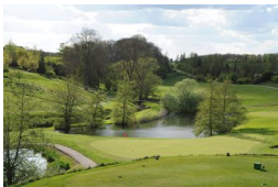
Two 18 holes golf courses and 9 hole par 3 course

Greetham Oakham, LE15 7SN, Rutland, England