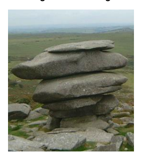
40. Bodmin Moor Walking and Climbing

A rugged and beautiful granite moorland in northeastern Cornwall