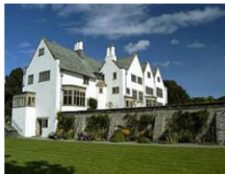
The Arts &amp; Craft House

Historic Buildings and Monuments, Parks Gardens and Woodlands, Visitor Centres and Museums, Childrens Attractions, Cafes Coffee Shops and Tearooms