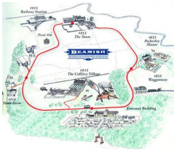
North of England Open Air Museum - all about life in the North East in the early 1800s and 1900s

Historic Buildings and Monuments, Parks Gardens and Woodlands, Tours and Trips, Visitor Centres and Museums, Childrens Attractions, Cafes Coffee Shops and Tearooms, Guided Tours and Day Trips