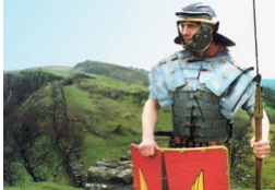
The most exciting site on Hadrian's Wall.

Hexham, NE47 7JN, Northumberland, England