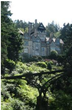
Former home of Lord Armstrong. The first house in the world to be lit by electricity.

Historic Buildings and Monuments, Parks Gardens and Woodlands, Visitor Centres and Museums, Cafes Coffee Shops and Tearooms