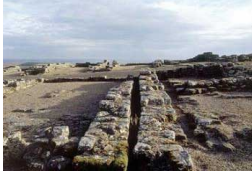
Roman wall snaking across dramatic countryside

Historic Buildings and Monuments, Parks Gardens and Woodlands, Visitor Centres and Museums, Childrens Attractions, Cafes Coffee Shops and Tearooms, Cycling and Mountain Bikes, Horse Riding and Pony Trekking, Walking and Climbing