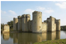
Perfect example of a late medieval moated castle

Historic Buildings and Monuments, Parks Gardens and Woodlands, Childrens Attractions, Cafes Coffee Shops and Tearooms