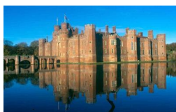
Magnificent moated castle in East Sussex

Historic Buildings and Monuments, Parks Gardens and Woodlands