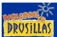
A collection of small and medium sized exotic animals Voted the number one attraction in Sussex for days out with the kids

Alfriston, BN26 5QS, East Sussex, England