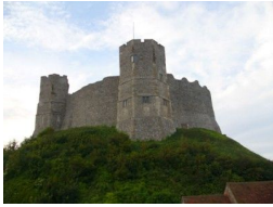
Magnificent Castle in Lewes East Sussex

Historic Buildings and Monuments, Visitor Centres and Museums