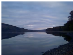
Loch Venachar, The Trossachs

Callander, FK8 3EN, Stirlingshire, Scotland