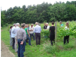
England's Oldest organic vineyard

ROBERTSBRIDGE, TN32 5SA, East Sussex, England