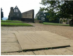
Battle Abbey and the famous battlefield in East Sussex