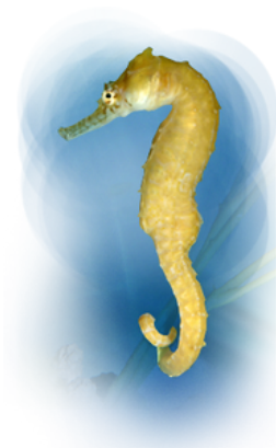
SEA LIFE Brighton is the world's oldest operating aquarium, with 140 years of marine discovery.

Nature Reserve, Tours and Trips, Visitor Centres and Museums, Aquariums, Childrens Attractions, Zoos Farms and Wildlife Parks, Cafes Coffee Shops and Tearooms, Boat Trips