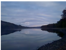
Loch Venachar, The Trossachs

Callander, FK8 3EN, Stirlingshire, Scotland