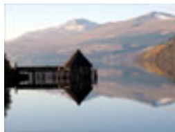
Archaeological Open-Air Museum

Kenmore Aberfeldy, PH15 2HY, Perth and Kinross, Scotland