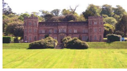
Red Stone Tudor Mansion