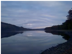
Loch Venachar, The Trossachs

Callander, FK8 3EN, Stirlingshire, Scotland